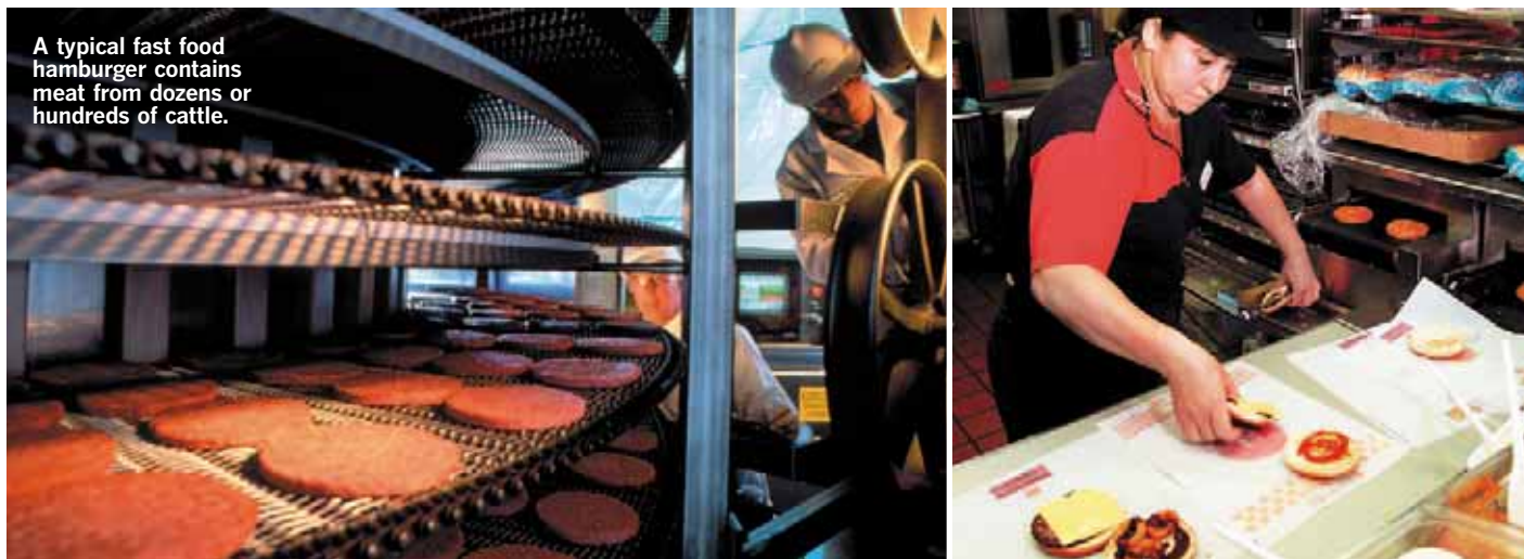
A typical fast food hamburger contains meat from dozens or hundreds of cattle.

franchises. Cooking instructions are not only printed in the manual, they are often designed into the machines. A McDonald's kitchen is full of buzzers and flashing lights that tell employees what to do.